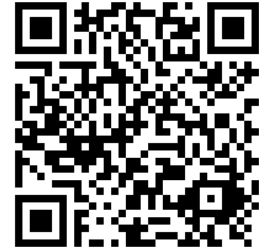
26 Oct – Day 3 Feedback Survey